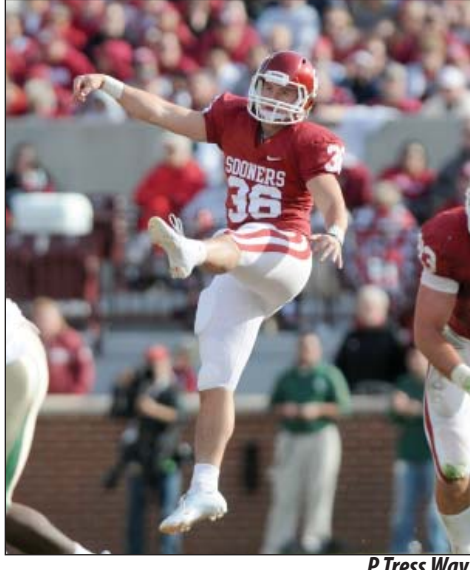
P Tress Way