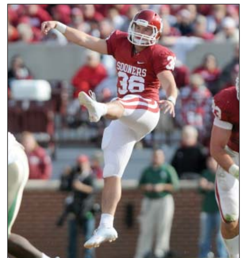
P Tress Way

Oklahoma opponents have returned eight punts for 35 yards. That ranks No. 25 in the nation. The Sooners rank No. 17 nationally in net punting at 40.1 yards.