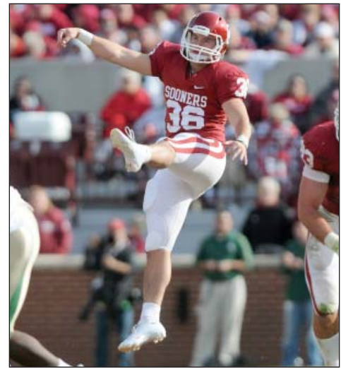
P Tress Way

returned 11 punts for 45 yards. That ranks No. 21 in the nation. The Sooners rank No. 18 nationally in net punting at 39.4 yards.