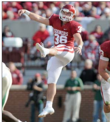
P Tress Way