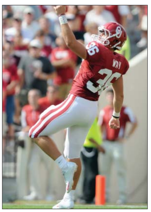
P Tress Way