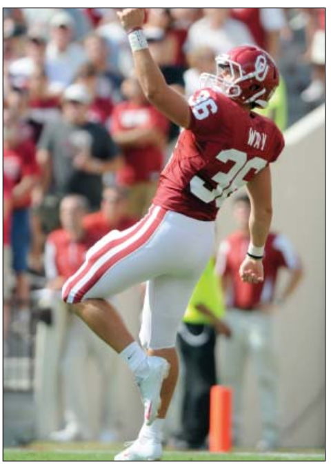
P Tress Way