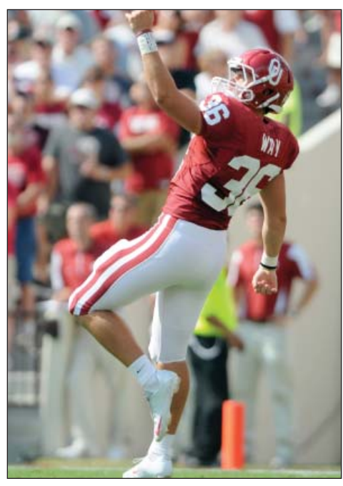
P Tress Way