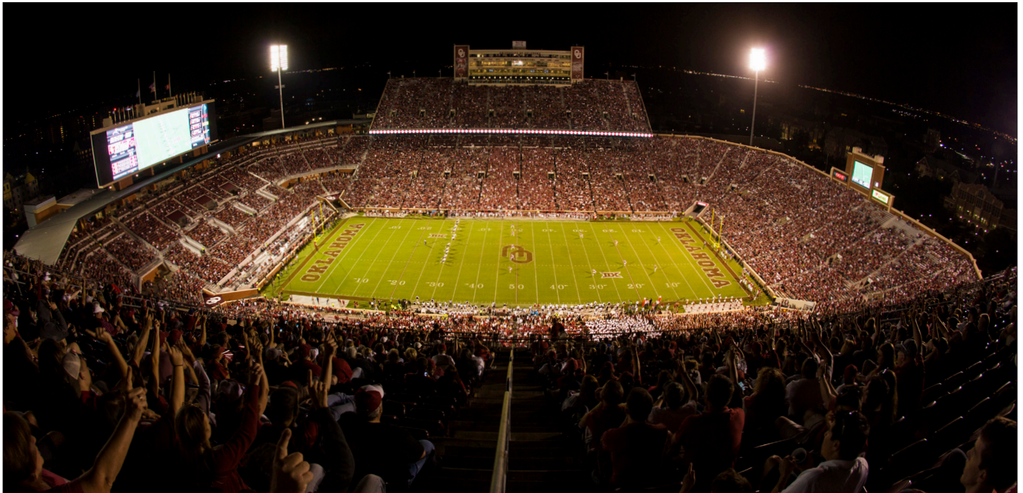
OU's $160 million stadium renovation and modernization project bowled in the south end of the facility and added premium seating and the second-largest collegiate video board.