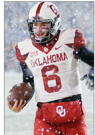
A finalist for the Maxwell and Davey O'Brien Awards, QB Baker Mayfield leads the nation in passing efficiency (194.7) and yards per pass attempt (10.9), while ranking second in completion percentage (.714). He has accounted for at least four touchdowns in seven of OU's eight conference games and three in the other.

► The Sooners have won the same number of Big 12 championships under Stoops (nine) as they have lost home games. OU is 100-9 (.917) at home under Stoops, with all 109 of those games sellouts. It is the best home winning percentage among Power Five schools over the last 18 seasons (Ohio State is next at .882). OU has outscored its