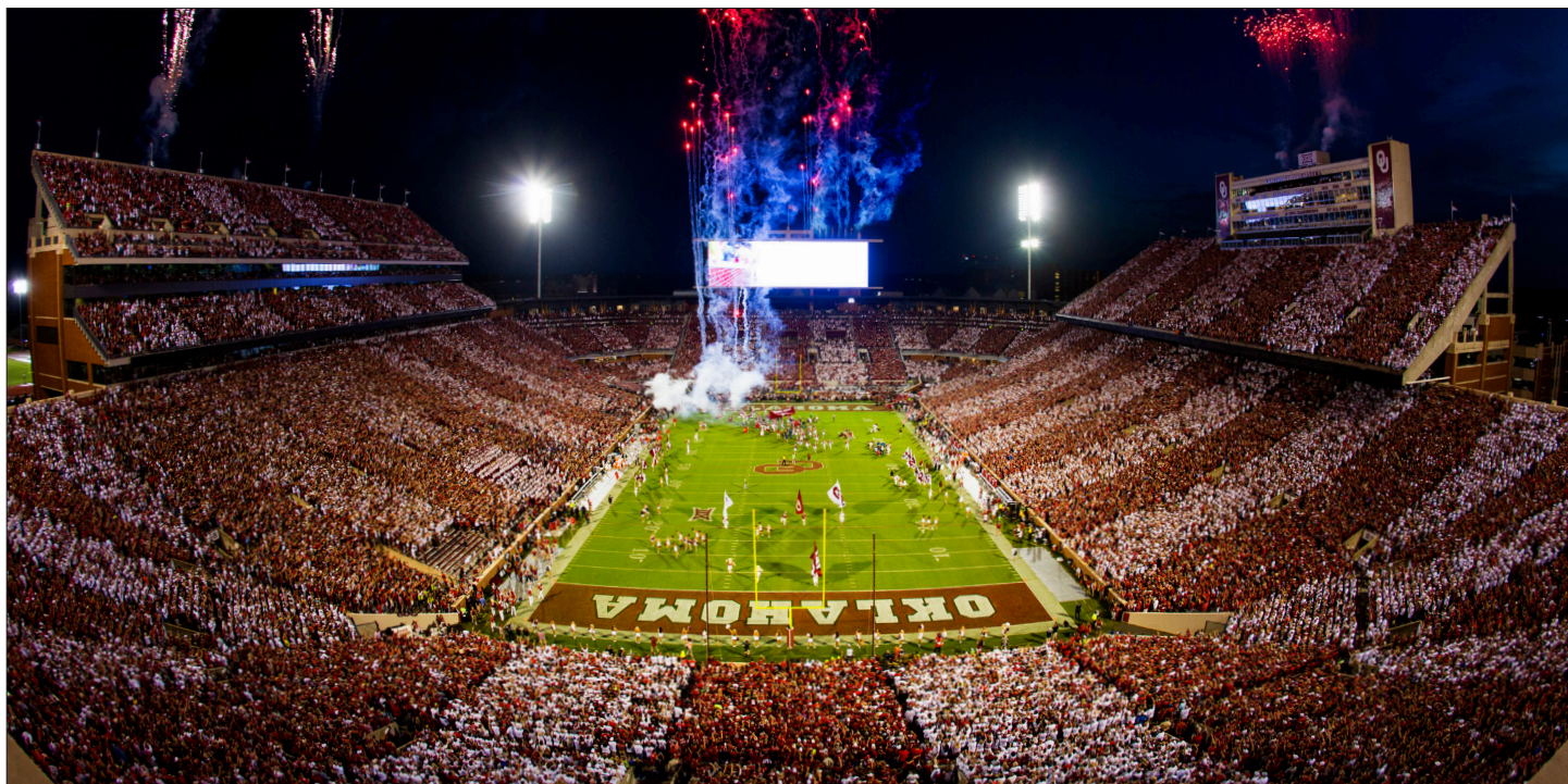
OU's $160 million stadium renovation and modernization project bowled in the south end of the facility and added premium seating and the second-largest collegiate video board.