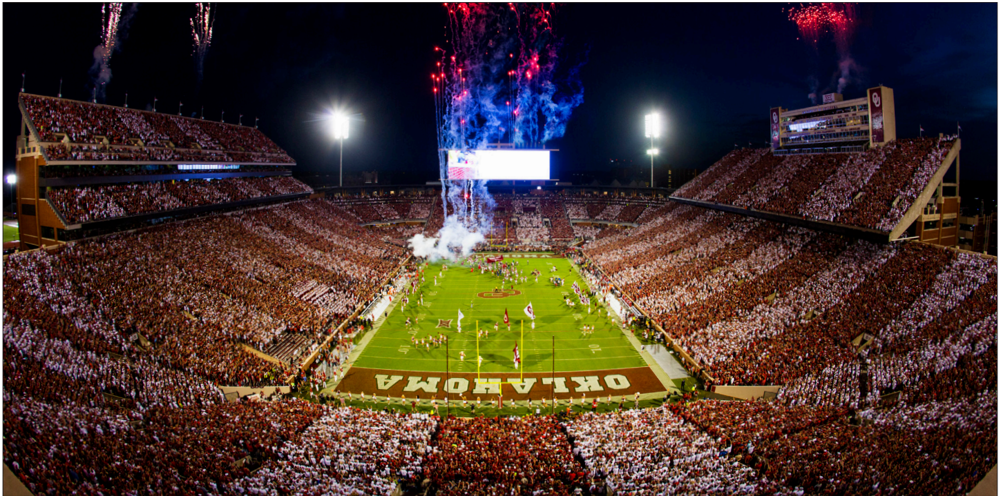
OU's $160 million stadium renovation and modernization project bowled in the south end of the facility and added premium seating and the second-largest collegiate video board.