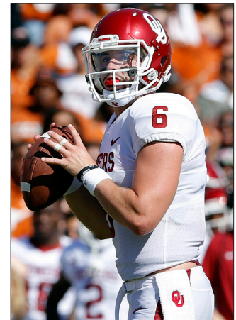
Baker Mayfield has accounted for 18 TDs (17 passing) against one turnover this season and leads the country in completion percentage (72.7), pass efficiency rating (207.3; next best in Power 5 is 191.0) and yards per pass attempt (12.0).

► Oklahoma's 13-game true road winning streak is tied with Alabama for the longest active streak in the country and tied for the third longest in school history. The program's only longer streaks were 14 games (1973-76) and