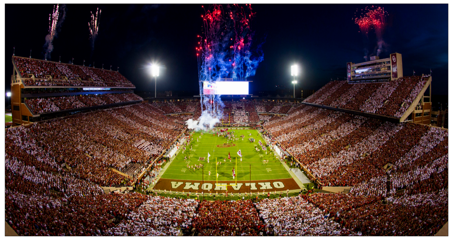
OU's $160 million stadium renovation and modernization project bowled in the south end of the facility and added premium seating and the second-largest collegiate video board.