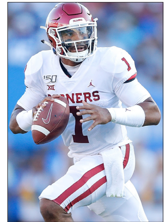
Jalen Hurts is the only FBS player since at least 1996 to register a passing efficiency rating of at least 245.0 (min. 18 attempts) three times in a season. It has taken him just three games to accomplish the feat.