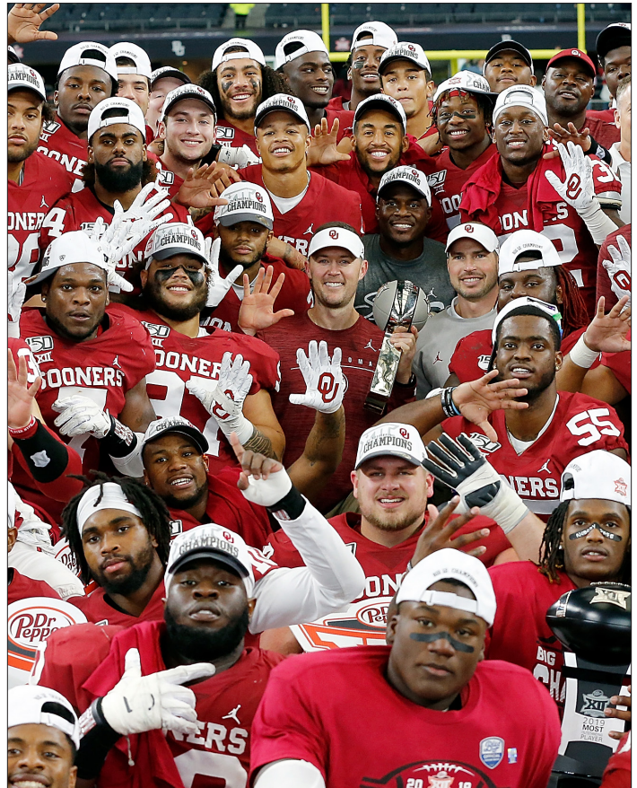
► CeeDee Lamb (top) was named Most Outstanding Player of the Big 12 Championship after his 173-yard receiving performance vs. Baylor. OU's Big 12 title was its fifth straight and 13th in the last 20 years.