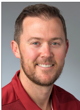
Lincoln Riley Head Coach/Quarterbacks Seventh Season at OU Fifth Season as Head Coach