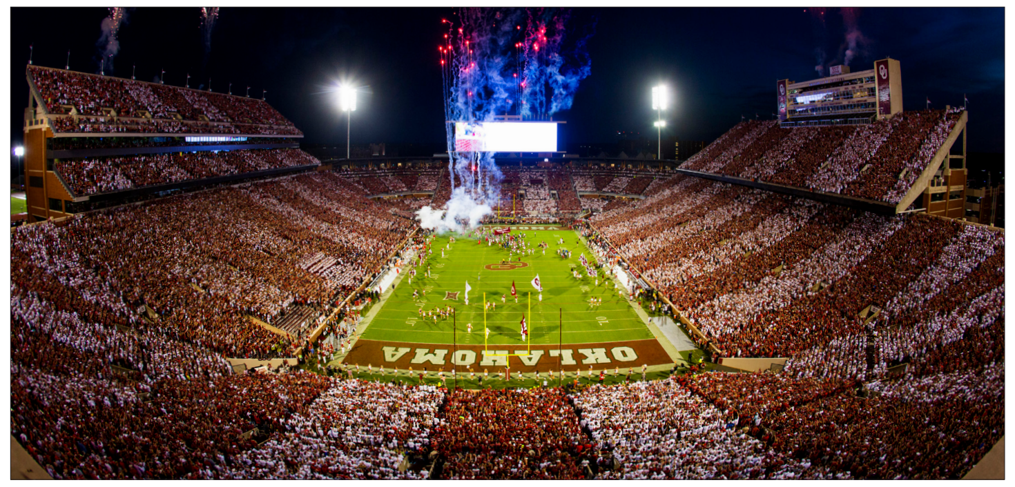
OU's $160 million stadium renovation and modernization project bowled in the south end of the facility and added premium seating and A 62-feet-by-38-feet video board.