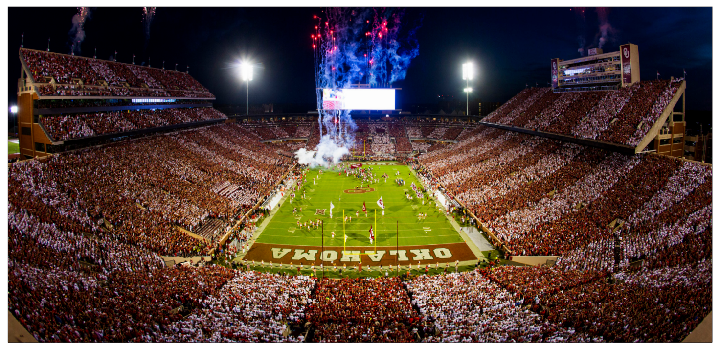
OU's $160 million stadium renovation and modernization project bowled in the south end of the facility and added premium seating and A 62-feet-by-38-feet video board.