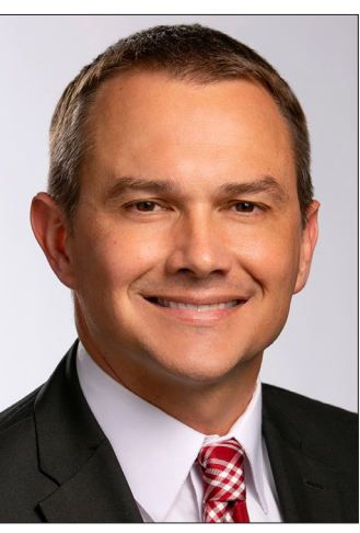
Brandon Hall Safeties