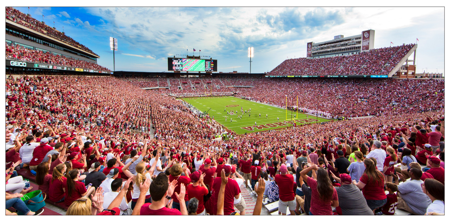
OU's $160 million stadium renovation and modernization project bowled in the south end of the facility and added premium seating and A 62-feet-by-38-feet video board.