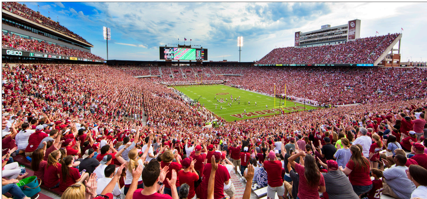
OU's $160 million stadium renovation and modernization project bowled in the south end of the facility and added premium seating and a 62-foot-by-38-foot video board.