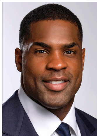
DeMarco Murray Running Backs