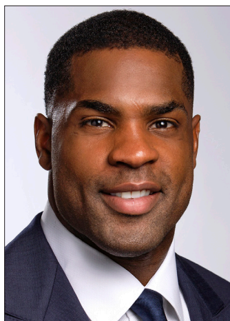
DeMarco Murray Running Backs