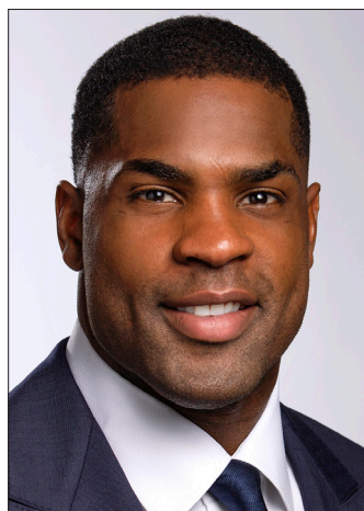
DeMarco Murray Running Backs