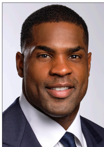
DeMarco Murray Running Backs