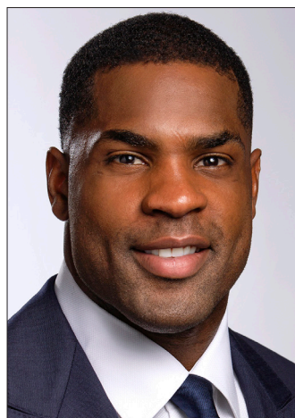
DeMarco Murray Running Backs